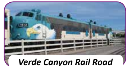
Verde Canyon Rail Road

Day Three – During the morning we will visit Montezuma Castle and Montezuma Well National Monuments, then travel to Cottonwood/Clarkdale and have lunch at Su Casa in Clarkdale. After lunch we ride the Verde Canyon Rail Road train through a scenic canyon to Perkinsville and return. We travel in a first class car with complimentary appetizers and full bar service. Accommodations are at the Best Western Inn and dinner is at the Black Bear restaurant.