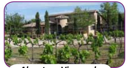
Alcantara Vineyards and Winery

Day Two – Most of the day will be spent at the Out of Africa Wildlife Park where we will experience oneness with animals and each other during safaris, tours, walks, observations and shows featuring wild-by-nature animals in their own natural splendor. We will have a box lunch at the Park. Then we visit the Alcantara Vineyards and Winery for a tour and canapes, and return to CCCH for a buffet dinner.