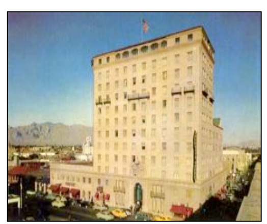
Pioneer Hotel downtown Tucson