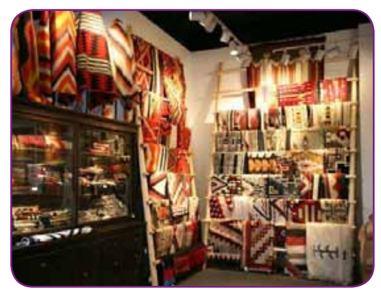
Medicine Man Gallery

and expert on Native American rugs, pottery and western art. We will view the Gallery's outstanding paintings, bronze sculptures, pottery and Navajo rugs.