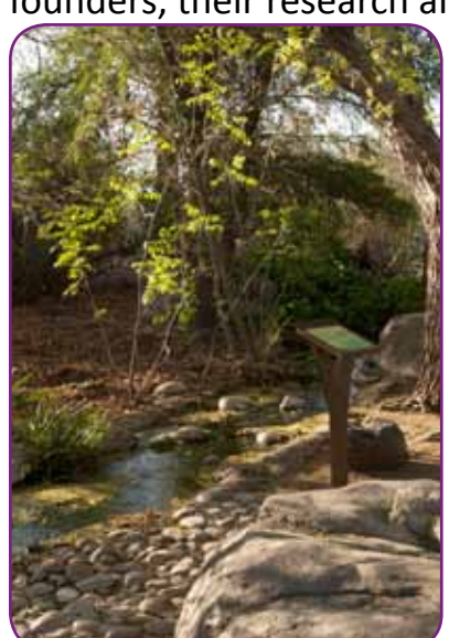
Tohono Chul Park, Demonstration-Garden