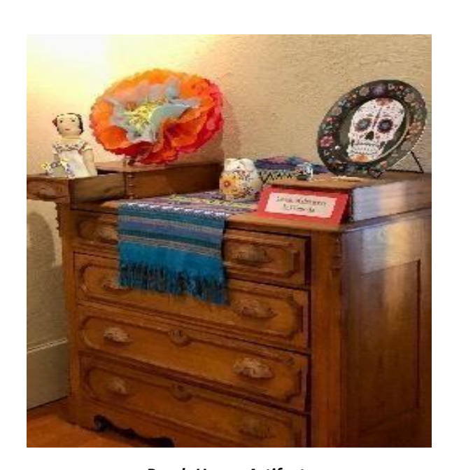
Pusch House Artifacts

Please remember that the Oro Valley Historical Society is now SUPPORTER based. We no longer collect annual dues. As such, we appreciate donations, gifts, and grants to support our exhibits, programs, research, and collections to keep Oro Valley History alive. Donations can be made on our website <a href="https://ovhistory.org">https://ovhistory.org</a> or via snail mail (just like in history!) at P.O. Box 69754 Oro Valley, Arizona 85737. Also, if you would like to volunteer to keep Oro Valley history alive, we would welcome your participation. History loves company!