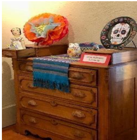
Pusch House Artifacts

Please remember that the Oro Valley Historical Society is now SUPPORTER based. We no longer collect annual dues. As such, we appreciate donations, gifts, and grants to support our exhibits, programs, research, and collections to keep Oro Valley History alive. Donations can be made on our website https://ovhistory.org or via snail mail (just like in history!) at P.O. Box 69754 Oro Valley, Arizona 85737. Also, if you would like to volunteer to keep Oro Valley history alive, we would welcome your participation. History loves company!